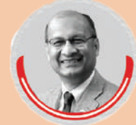
Amb. Vishnu Prakash IFS India's High Commissioner to Canada